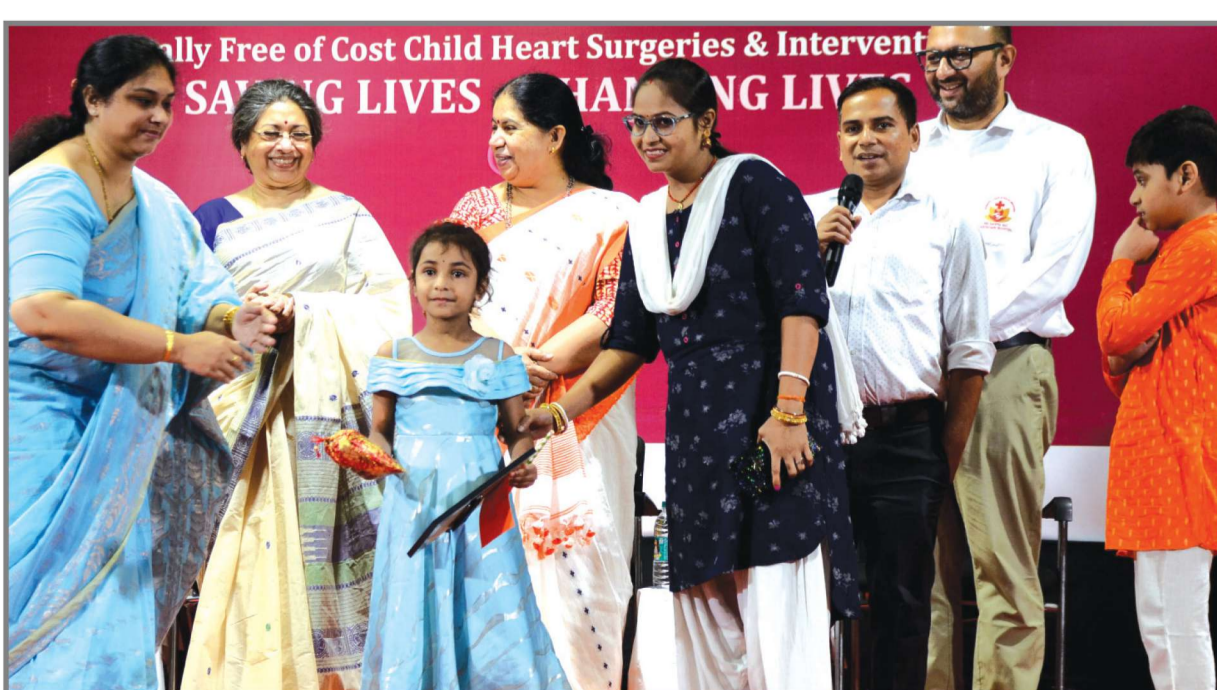
Celebration of 30,000 free pediatric cardiac surgeries performed at Sri Sathya Sai Sanjeevani Hospitals at Rotary Sadan. #SNS