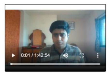
Figure 2: Output of Video Tag