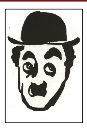
Fig.7B Charlie Chaplin, by Ray, Satyajit

And last but definitely not the least, a portrait of Pablo Picasso , the world famous painter, is a masterpiece itself. In this sketch Ray used geometric lines and elements to draw the famous painter's face.