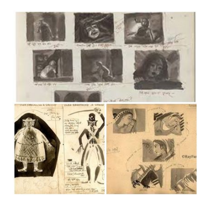
Fig.6C Script Visualization