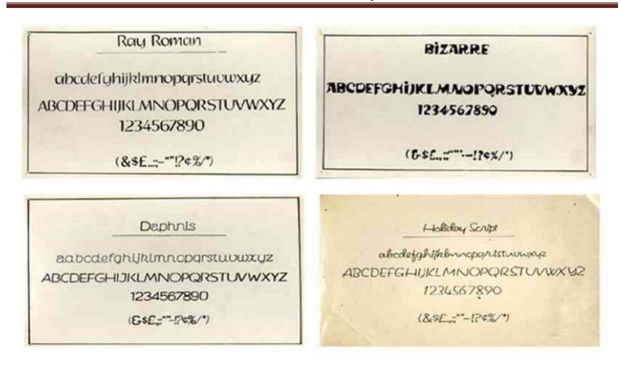
Fig.8A English Typography Designs by Satyajit Ray

He also invented dozens of Bengali designs. His Bengali typography designs are commonly known as The Satyajit Ray Styles . These are still in use at SANDESH (সাম্পো) magazine.