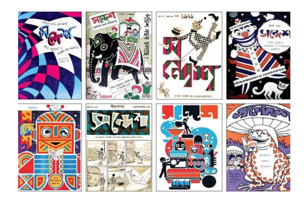
Fig.8B Bengali Typography Designs for SANDESH magazine by Satyajit Ray

He also invented dozens of Bengali designs. His Bengali typography designs are commonly known as The Satyajit Ray Styles . These are still in use at SANDESH (সাম্পো) magazine.